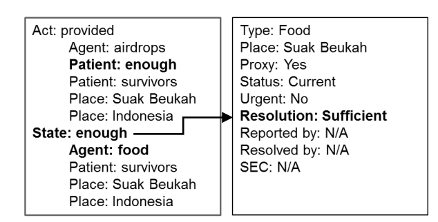
Figure 6: Mapping resolution information

Looking at the SF Food need frame, we see that it is also possible to ascertain Resolution information: