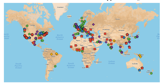
Figure 1: LDC Global Network of select data sources including subcontractors and vendors (red squares), corpus authors (green circles), media providers (purple diamonds), LDC staff collections (gold diamonds), research collaborators (blue stars). Many markers represent multiple collaborators; many markers partially obscured by others.

LDC is a consortium of educational, research and technology development groups in the academic, government and commercial sectors joined by a common need for language resources. Not a store but rather a mutual support organization, the Consortium's members contribute typically in the form of annual fees, though other inputs are possible, and benefit from the many language resources published by the management office hosted at the University of Pennsylvania. The Consortium has always maintained an international focus and its membership has grown to form a global network of LR users and contributors necessary to support the goal of documenting the world's languages. A snapshot of LDC's global network of members and contributors appears in Figure 1 .