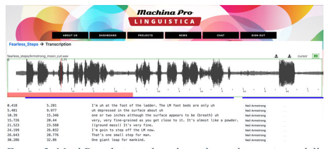
Figure 5: MachPro eliciting data through novel incentives: skills development, access to resources, supplemental learning.

Finally, NIEUW has developed Machina Pro Linguistica , (hereafter MachPro)<sup>6</sup> for language professionals, linguists and others who work with language regularly, and may be motivated to contribute as a way to develop their professional skills, supplement their learning or gain access to resources in exchange.