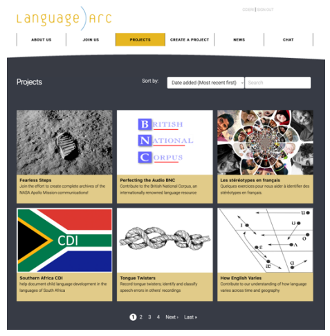
Figure 3: LanguageARC eliciting data and judgements through novel incentives: learning, altruism, local pride