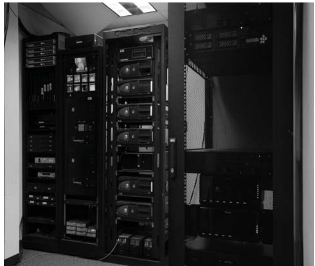
LDC Recording Lab, Philadelphia, PA, USA

LDC designed the broadcast collection system to be modular, regularized and automated. All recording nodes are interchangeable, filenames and database fields follow consistent, formal rules and signal interconnects are also consistent. Humans audit the collected data and adjust the schedule as needed.