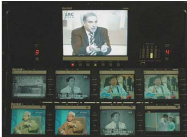
A/V Matrix Switch Display